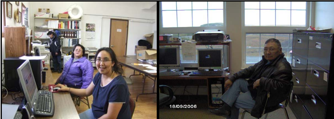
Brevig Mission E-Commerce Center