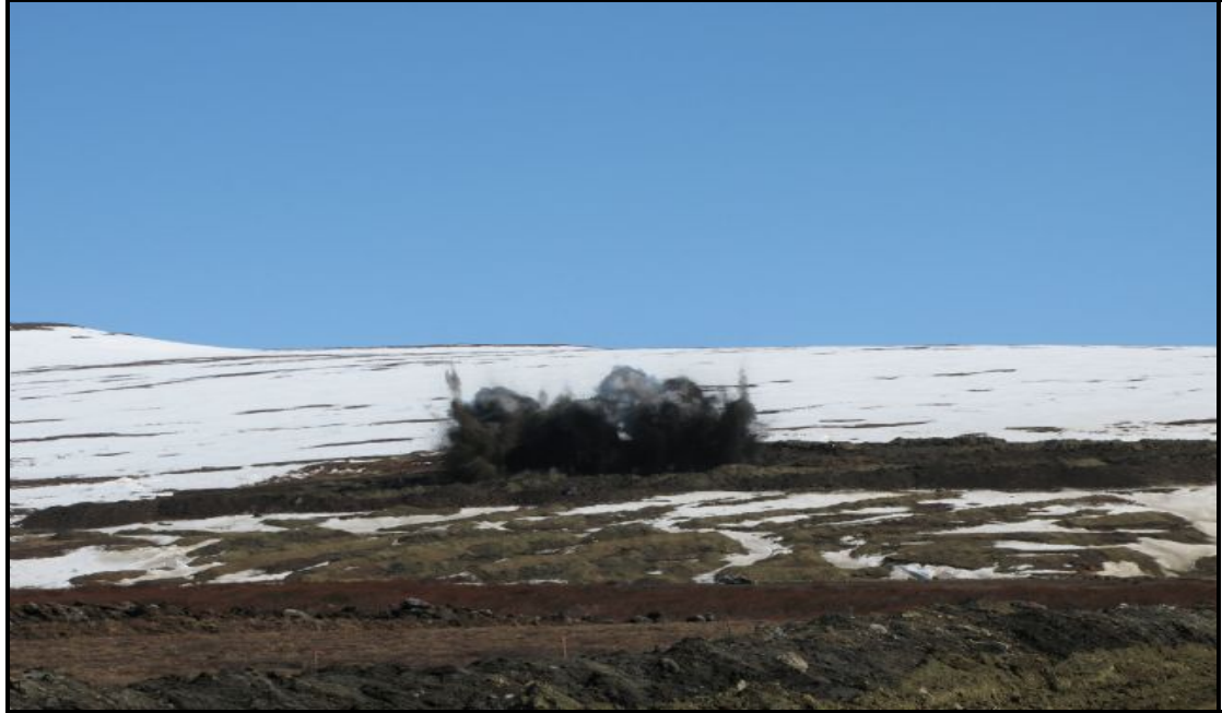
May 2007 – First Blast at Rock Creek – Photo from NovaGold Website